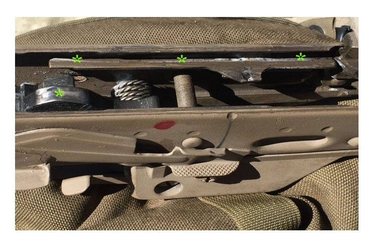
Receiver: showing one of the rails and the hammer that are lube points