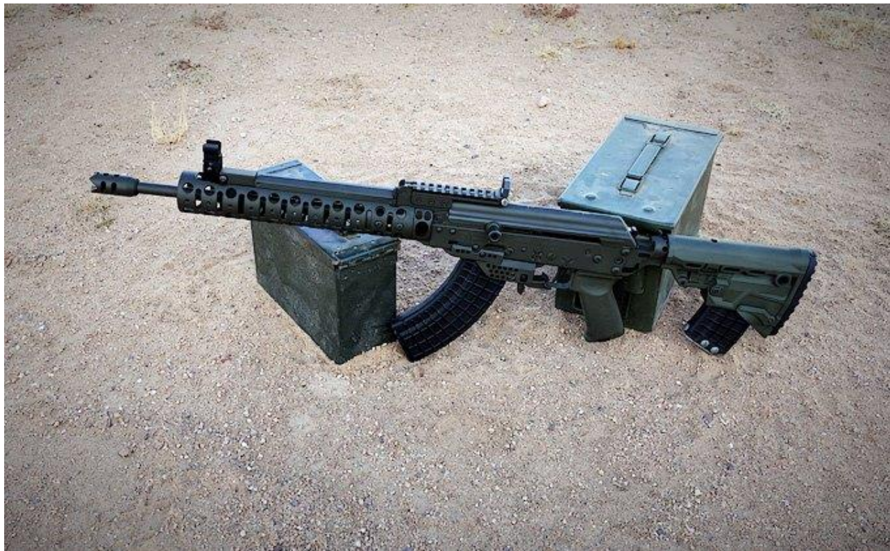
DL Sports Inc SLR Carbines