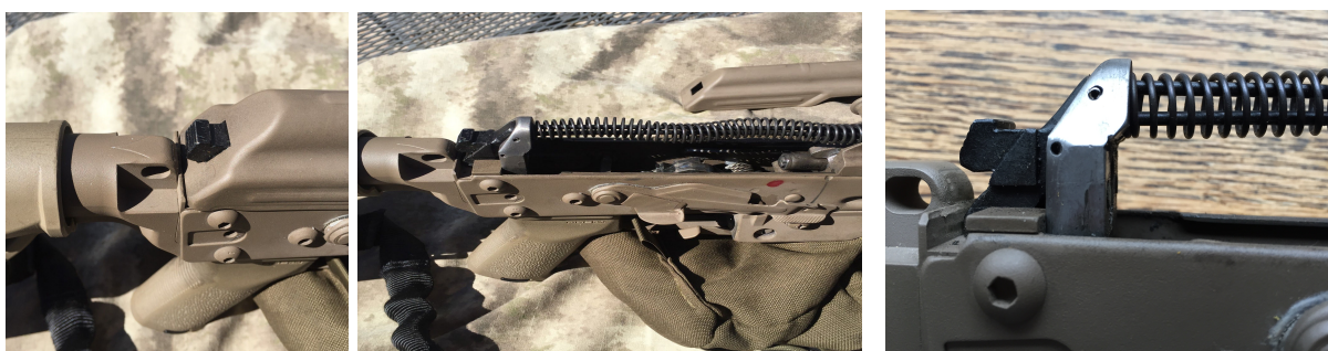
Step 1 Dust Cover Release & dust cover removal. Note 2 roll pins in recoil block in 3rd picture