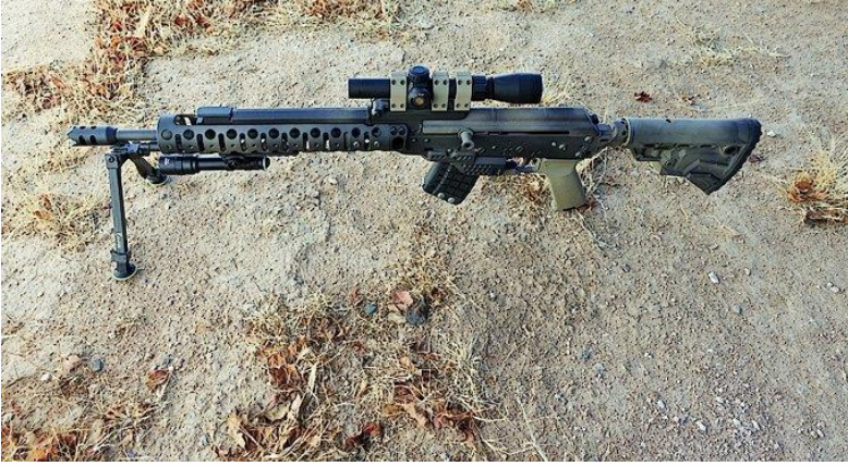
Neopod on SLR