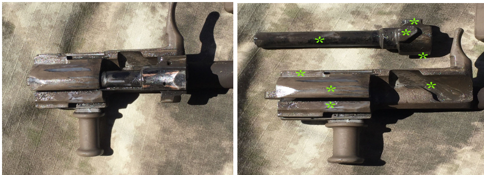
Underside of bolt carrier