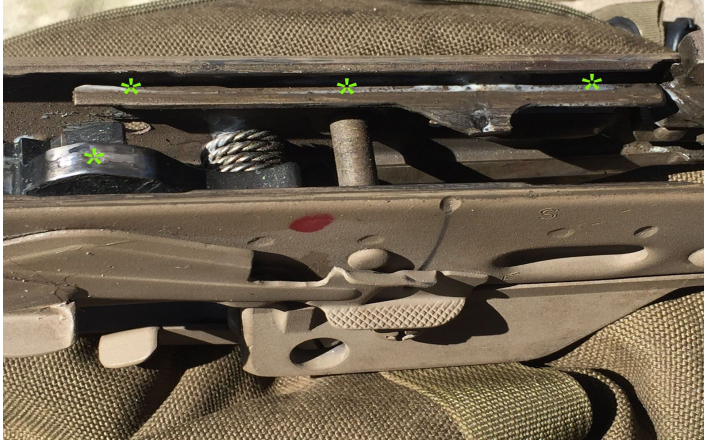
Receiver: showing one of the rails and the hammer that are lube points