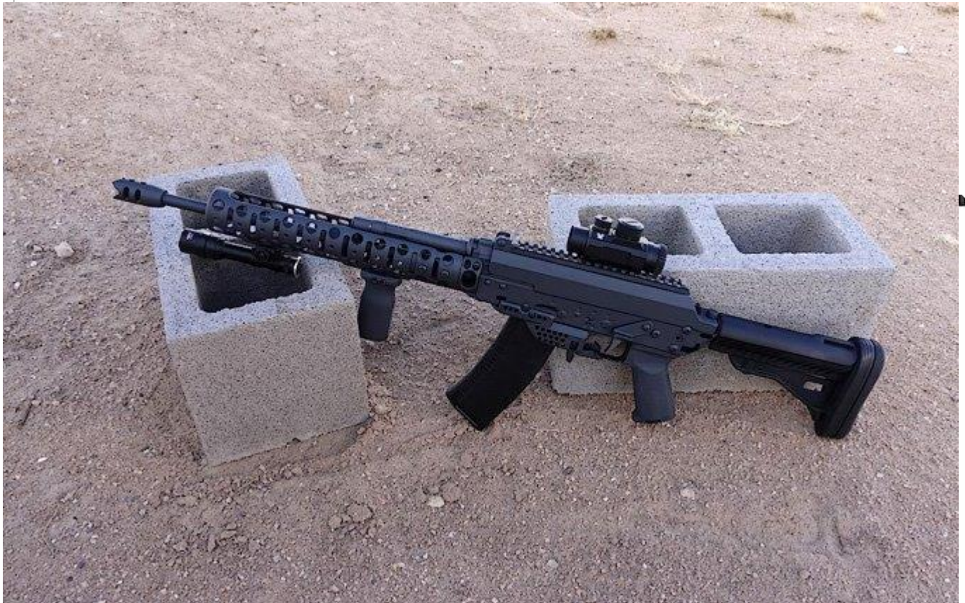
DL Sports 5.45 SLR Carbine